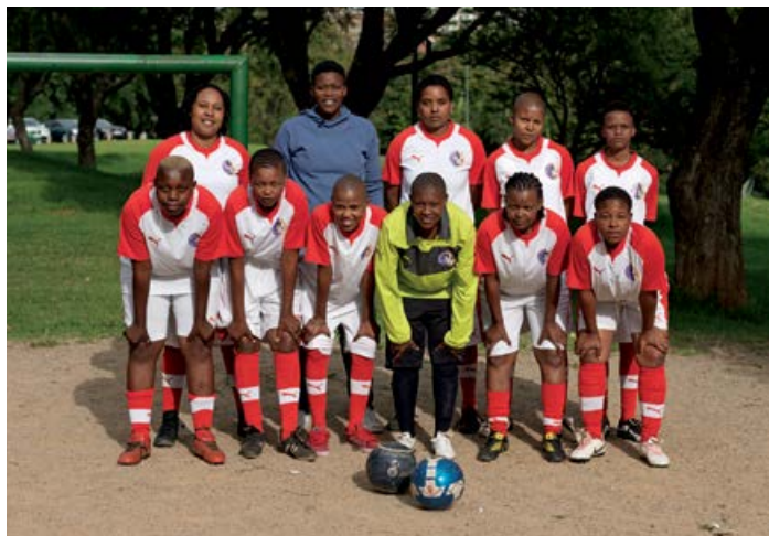
▲ Chosen FEW, Johannesburg, South Africa. April 2014. Chosen FEW, Johannesburg, Afrique du Sud. Avril 2014.