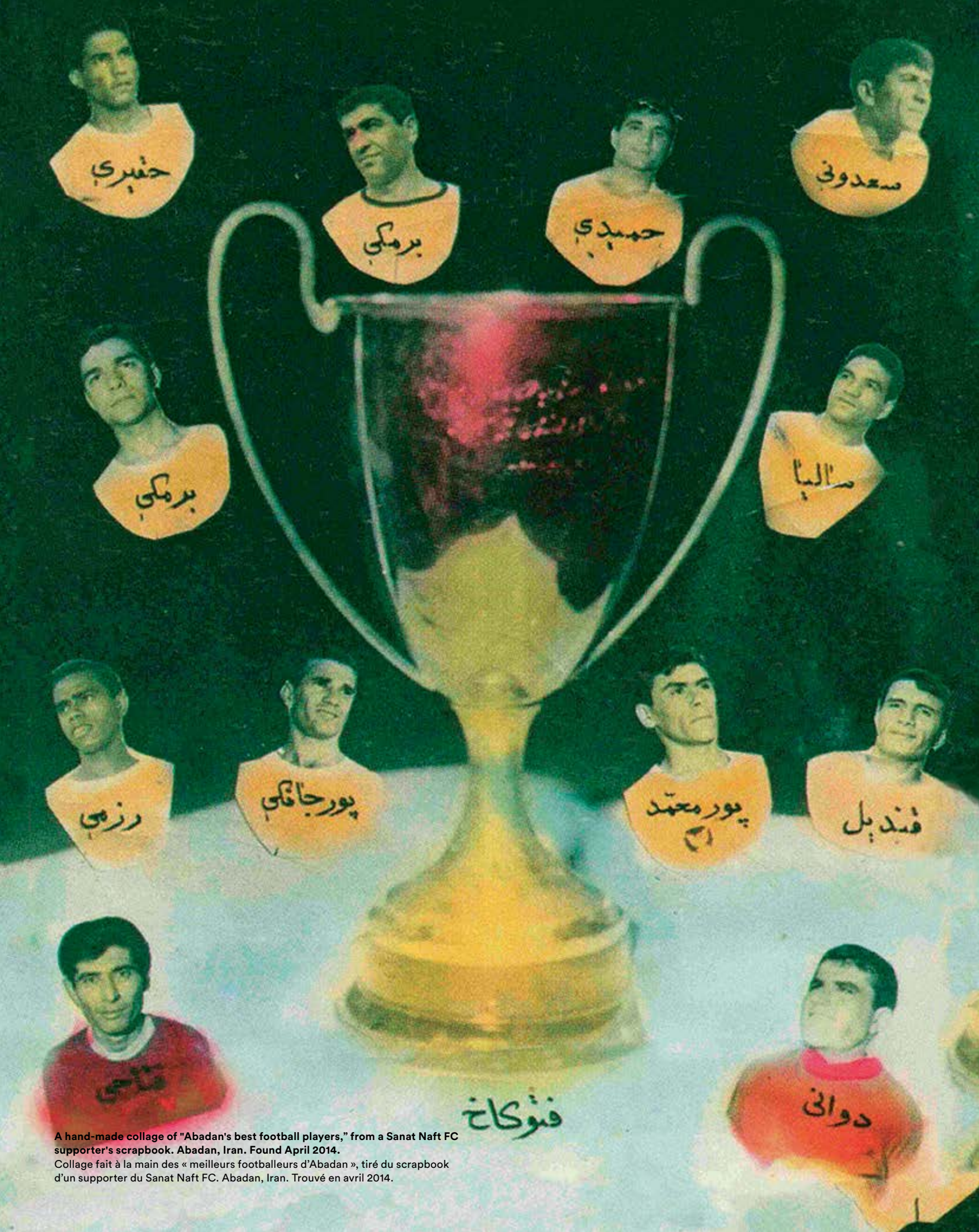
A hand-made collage of "Abadan's best football players," from a Sanat Naft FC supporter's scrapbook. Abadan, Iran. Found April 2014. Collage fait à la main des « meilleurs footballeurs d'Abadan », tiré du scrapbook d'un supporter du Sanat Naft FC. Abadan, Iran. Trouvé en avril 2014.