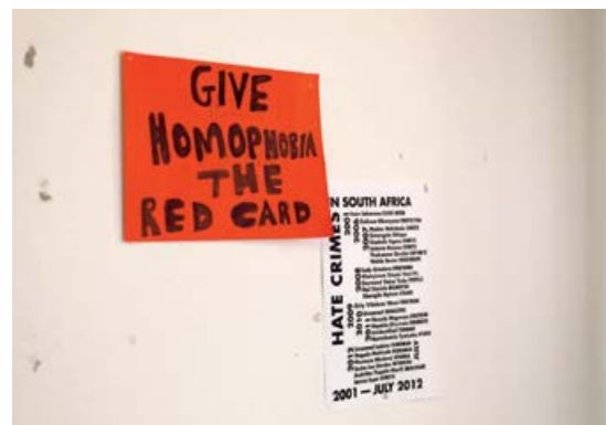
▲ Anti-homophobia posters in Chosen FEW's headquarters. Posters contre l'homophobie au QG de Chosen FEW.

« Dans le football, ‘gay’ est encore un gros mot », a déclaré le milieu de terrain allemand retraité Thomas Hitzlsperger au quotidien Die Zeit à l'occasion de son coming out en janvier 2014. Aucun footballeur de la Premier League en activité n'a jamais fait de coming out, et bien qu'en 2012 l'entraîneur de l'équipe nationale italienne Cesare Prandelli avait invité ses joueurs gays à le faire, tout est retombé dans l'oubli. Pour les joueurs internationaux, sortir de l'ombre pourrait signifier sortir du terrain ; en Russie, pays qui accueillera la Coupe du Monde 2018, les étrangers gays risquent l'expulsion, et le Qatar, pays hôte en 2022, aurait le projet d'enquêter sur l'homosexualité des visiteurs dès leur arrivée.